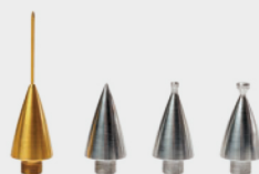
APPLICATORS FOR JETT PLASMA LIFT MEDICAL